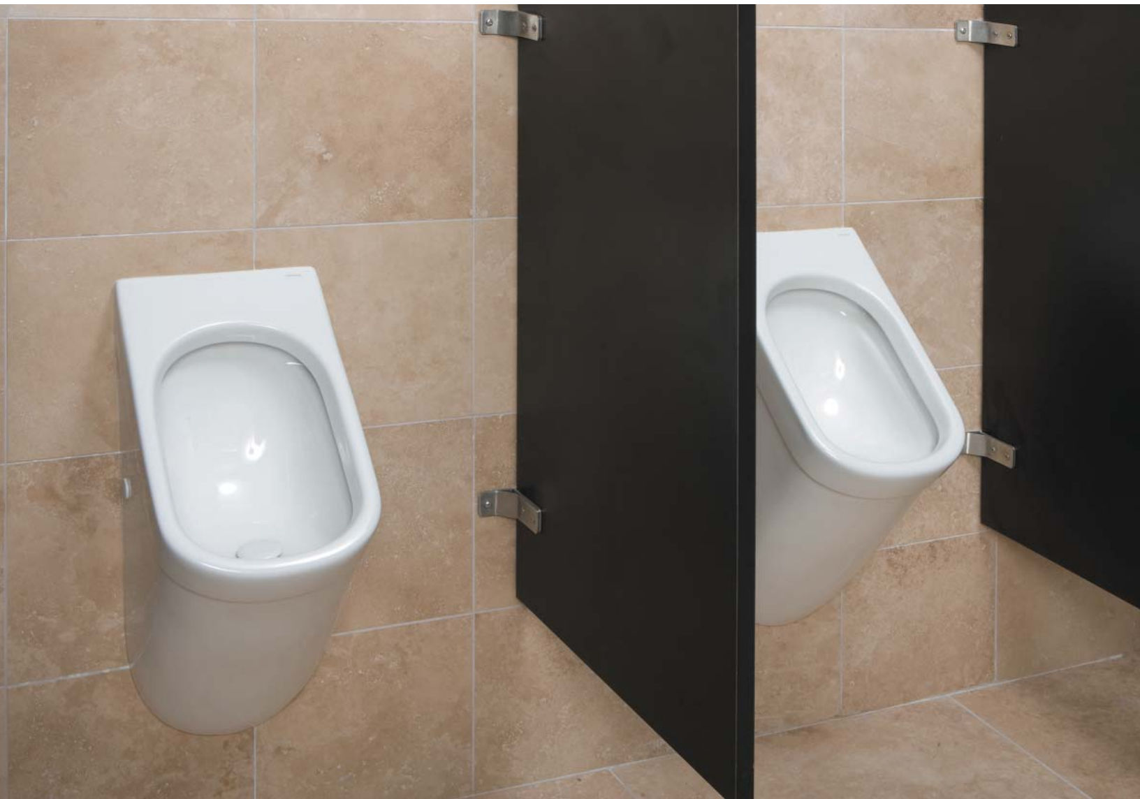
Cube 3 Ultra