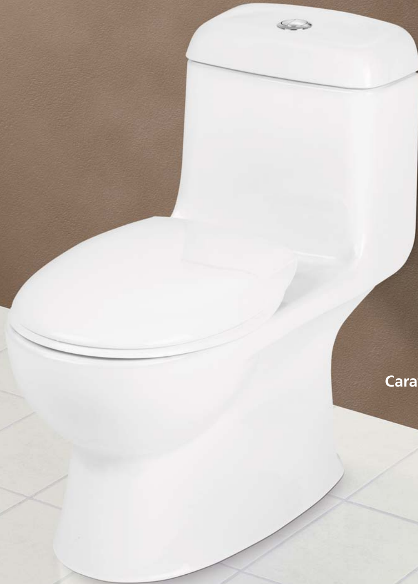
Caravelle One Piece

1.6/0.8 gpf (6/3 l) water saving Dual flush high efficiency toilet